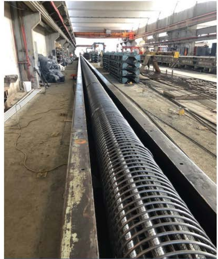
Precast Pile Line at Concrete Tech in Tacoma